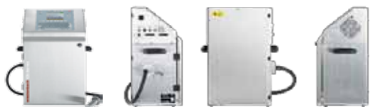
CS Series Contrast & Speed